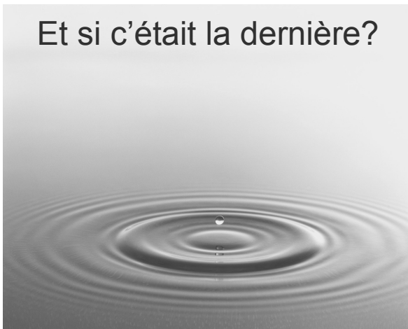
And if it was the last one?

Picture 1 Pamphlet from the city of Hyères-les-Palmiers in France