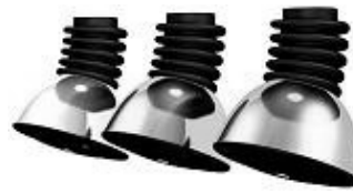
Picture 2 Water saving showers

The water flow through an ordinary shower, handheld or wall fixed, is in average 16 liters per minute. According to a recently published study in Australia the average shower time is 7 minutes. Then they have not measured the time spent there by teenagers. Some persons tend to have more than one shower per