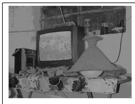
Picture 1 Homes with television sets in rural Zanzibar become the evening gathering point in the neighbourhood

watching television produced shifts in the physical and social configuration of houses.